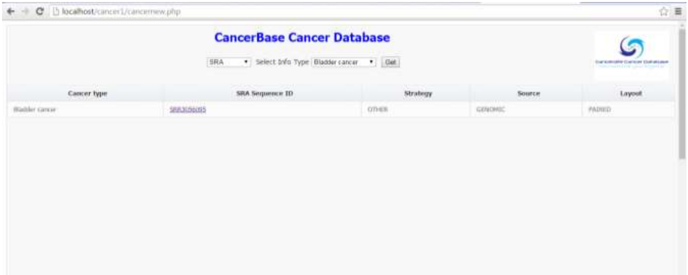
Figure 4. The CancerBase Database for SRA information

A database website is created using MySQL and PHP with the following graphical user interface.